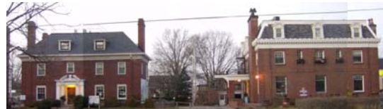
11027 Magnolia Drive 11101 Magnolia Drive